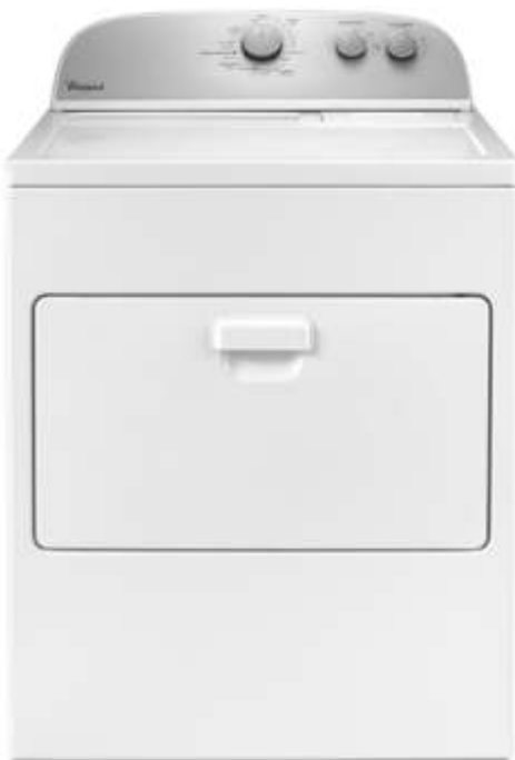
WH3LWEB4830 Vented Dryer