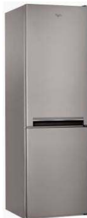
WHBSNF81010X 60cm Combi fridge & freezer