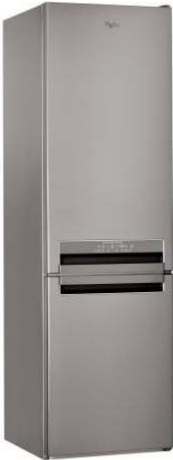
BSNF978200X Bottom-Mount Fridge/Freezer