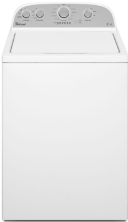
WH3LWTW4815FW Top loading washing machine