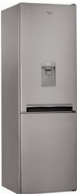
WHBSNF81010X 60cm Combi fridge & freezer AQUA