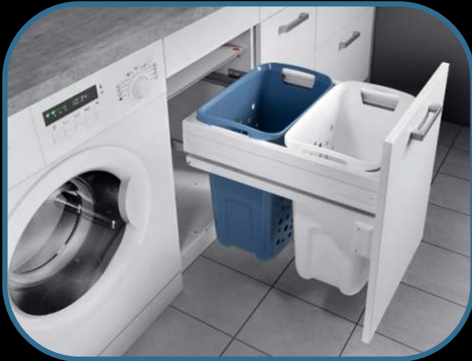
Laundry Carrier 450 HA327045