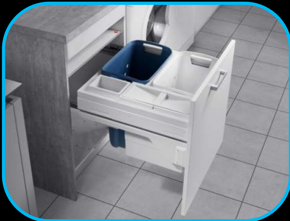
Laundry Carrier 600